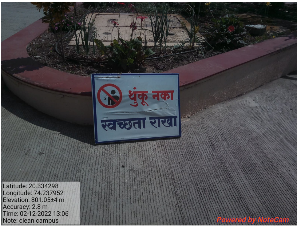
Figure 4 Board highlights the cleanliness warnings

There is limited plastic use in the functions and day to day practices. Students are well aware for the no use of plastics hence in any departmental or institutional function we avoid the use of plastics.