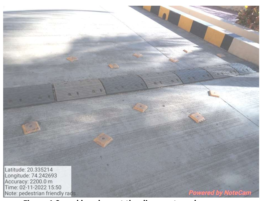
Figure 1 Speed breakers at the divergent roads

All the internal roads in the campus are well served for the transportation. There are separate pedestrian pathways aside to main roads. Main road is having safety measures, rumble straps, for maintaining the traffic rules. Dividers at the cross junction are well maintained.