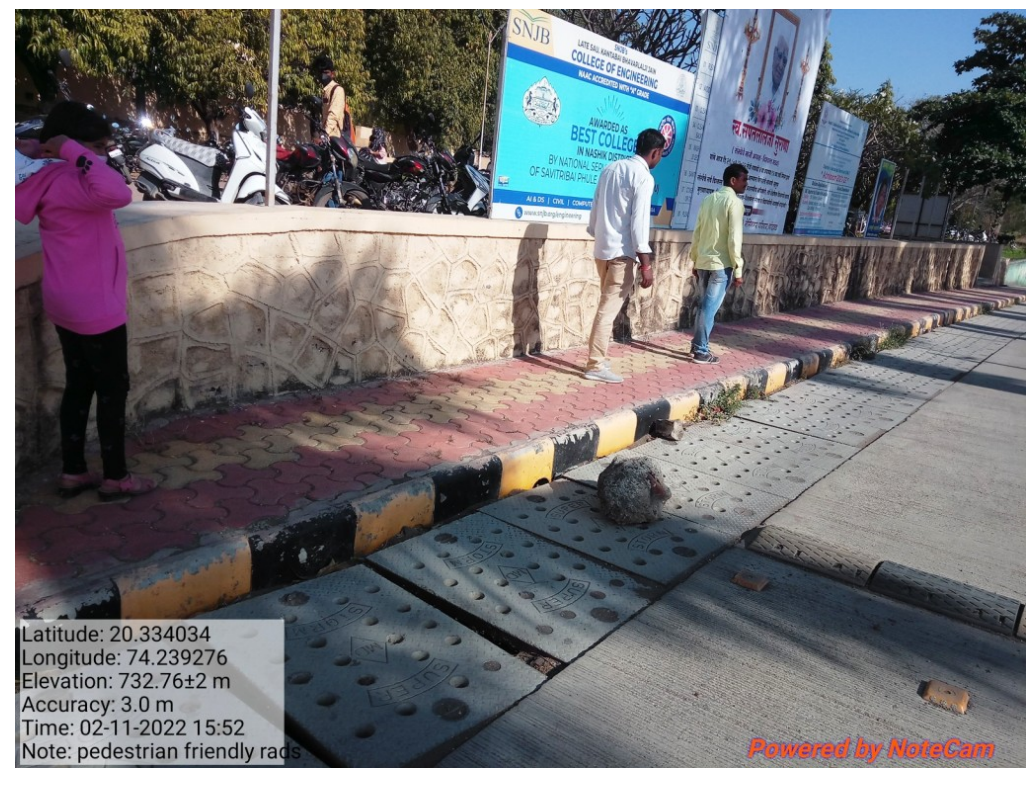
Figure 3. Well constructed Foot paths on main Road in the campus