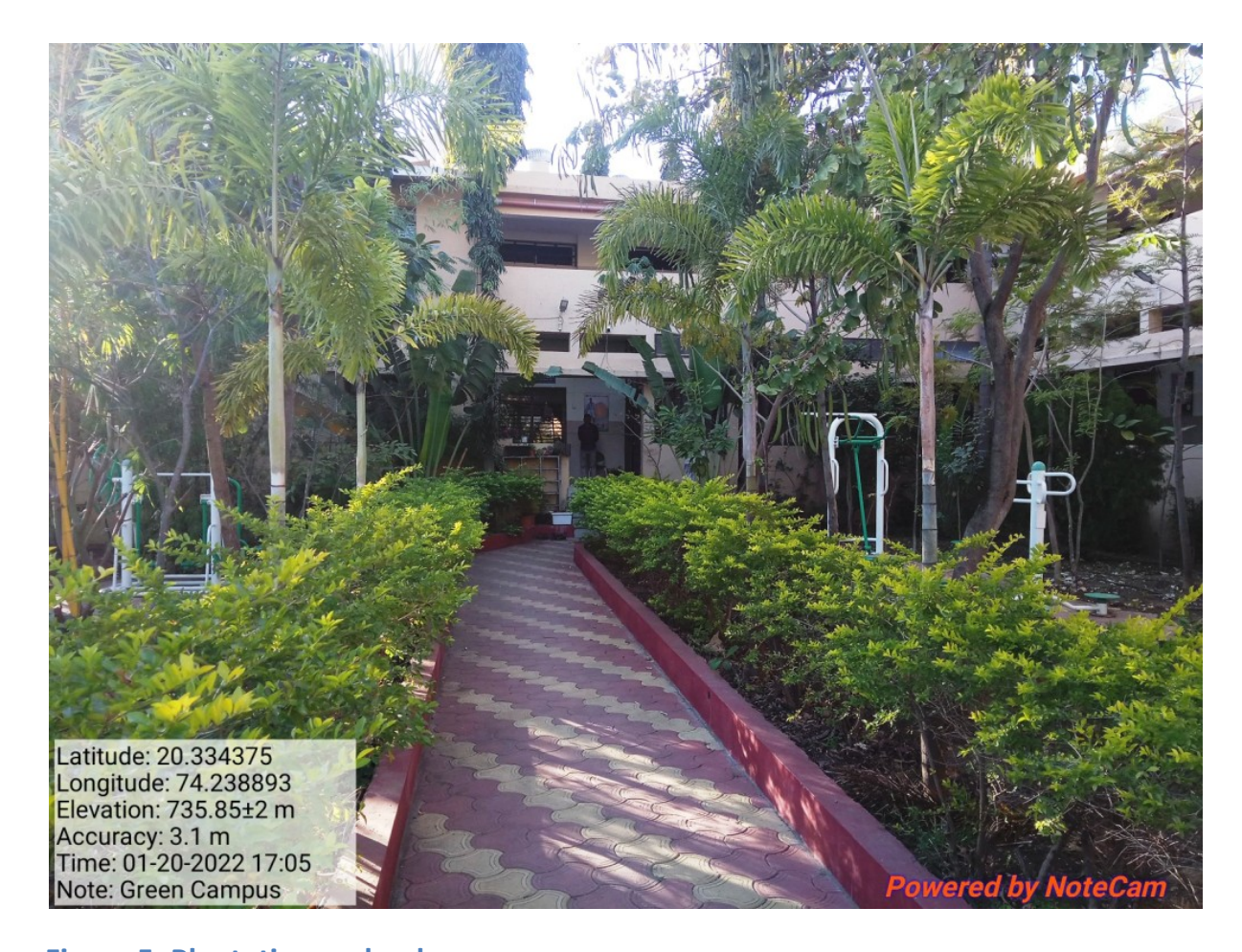
Figure 5. Plantation on land