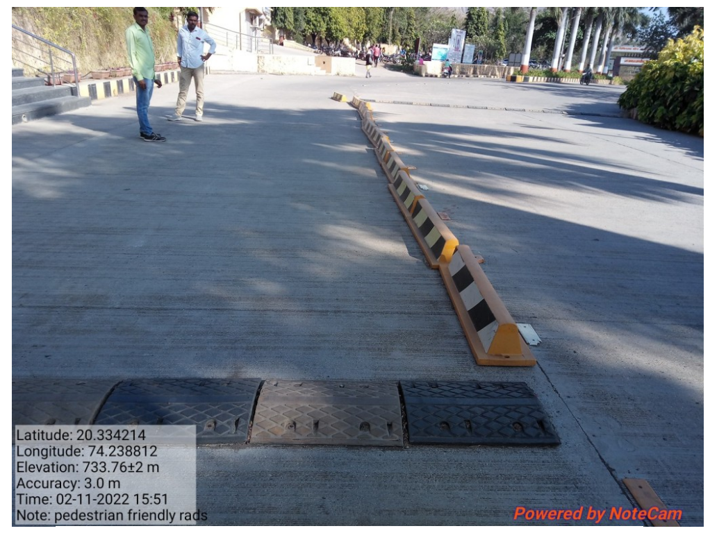
Figure 2 Dividers and Rumble straps